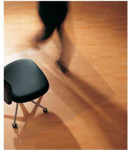
Ecogrip® Series 12 with antislip layer

On softer flooring such as carpets rounded anchor grips keep your mat in place.