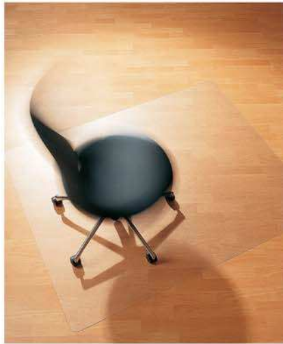
Ecogrip® Series 11 with anchor grips

Ecogrip® is made out of Makrolon®. This high-tech material is absolutely resistant against breakage and impact and offers an extremely long life of use. Additionally Makrolon® is entirely recyclable and thus contributes to an economical use of those raw-materials presenting the necessary resources for the production.